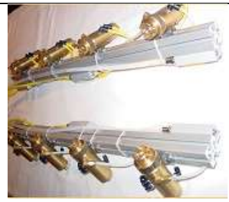
Rack of nozzles

VIBRACO studies your needs and determines the best microlubrication or spray solution. VIBRACO, manufacturer , has the means to supply quickly systems and spare parts.